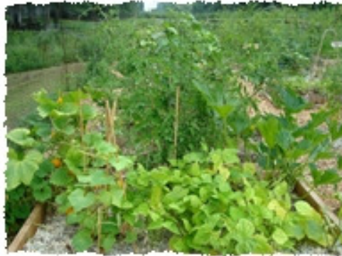
New Community Garden

Visit our website at www.jonesbridge.org Email our Membership Director at membership@jonesbridge.org or phone 678-318-1395