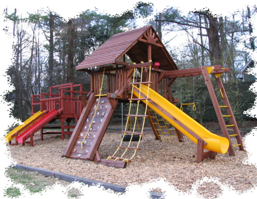
Year-round club park