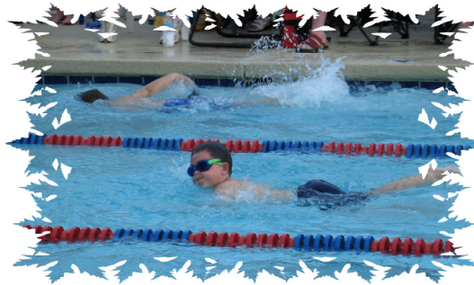
Learn how to swim